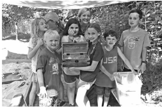
Campers in Archaeology found the magic key and got to unlock the treasure box. Way to go!